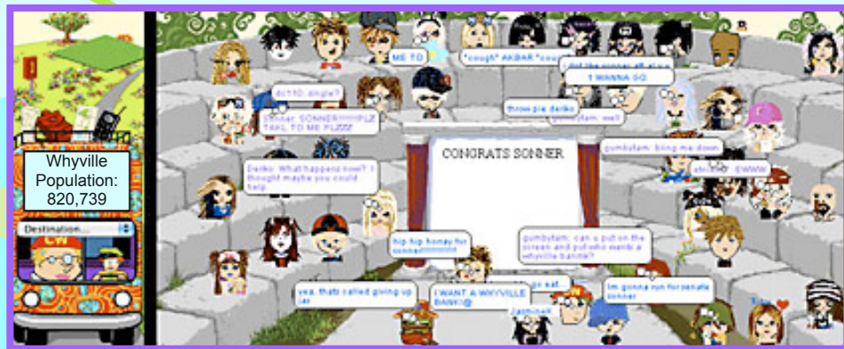
Whyville's Greek Theater

An example of this system implemented for children ages 8-14 can be seen at Whyville.net. Whyville is a favorite after-school destination for children around the world, with more than 1.6 million members and 50 million page views per month.