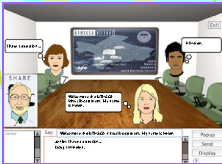
One of UTHSCA's virtual meeting rooms

Numedeon has also implemented a virtual campus for the University of Texas Health Science Center in San Antonio through which scientists and medical professionals collaborate locally and at a distance.